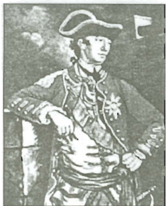
General William Howe