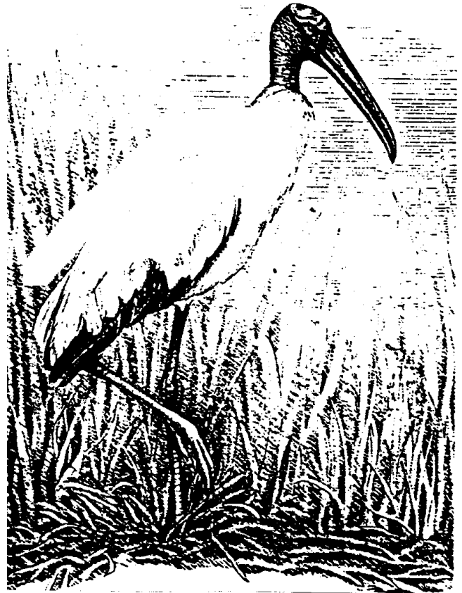
Figure 1. Wood stork ( Mycteria americana )

U.S. wood storks occur in tropical and subtropical wetlands, with colonies in Florida, Georgia, and South Carolina at the northern edge of the species' range. Wood storks still occur--but no longer breed--in Texas, Louisiana, Mississippi, and Alabama. Their range extends south to northern Argentina. Following the nesting season wood storks can be seen throughout the U.S. southeastern coastal plain.